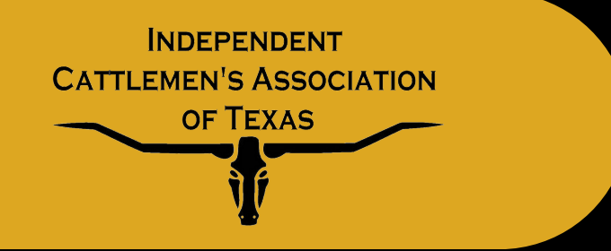
Exhibit Space Contract & Lease

** Please Complete & Return Pages 2 & 3**